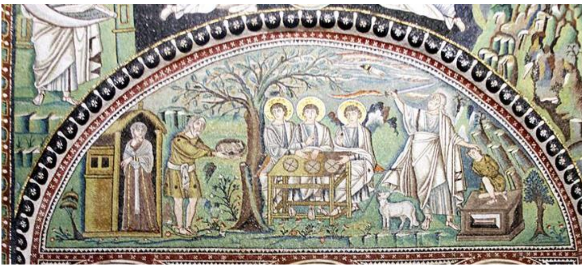
6 th Century mosaic in San Vitale Basilica, Ravenna

The Lord appeared to Abraham by the oaks of Mamre, as he sat at the entrance of his tent in the heat of the day... Genesis 18.1-15